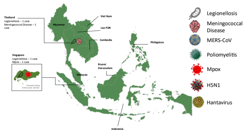
Figure 1. Distribution of EID cases in the ASEAN Region in Epi-Week 11

In Epi-Week 11, there were two cases of Legionellosis in Singapore and Thailand respectively with no deaths. A new case of Meningococcal Disease was reported in Thailand with no deaths. Furthermore, one case of Mpox was found in Singapore with no deaths. Meanwhile, neither cases nor deaths reported for Avian Influenza (H5N1), Hantavirus MERS-CoV and Poliomyelitis during Epi-Week 11 in the ASEAN region.