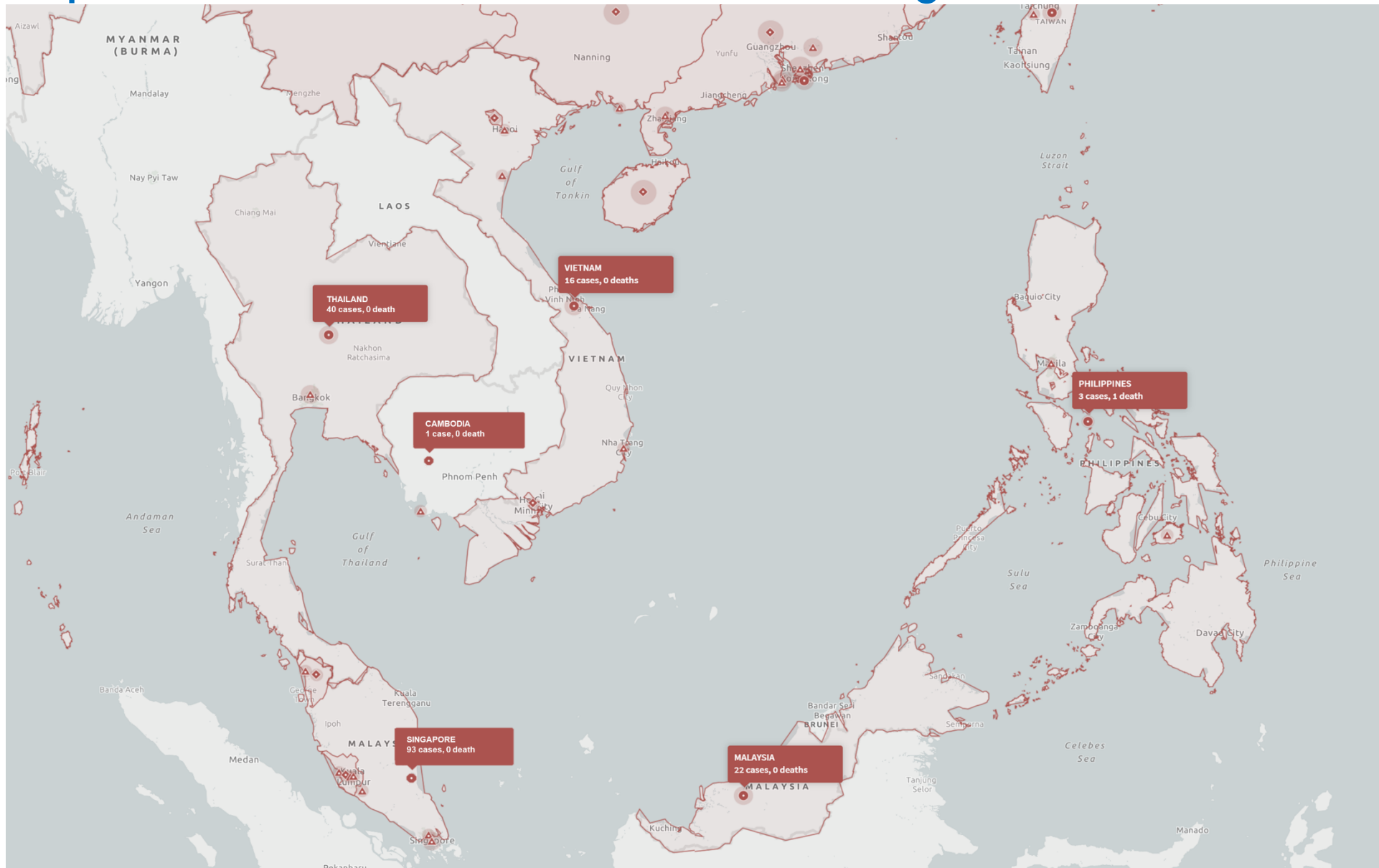
Figure 2. ASEAN Region with COVID-19 confirmed cases as of February 28, 2020 (2 PM GMT+8)