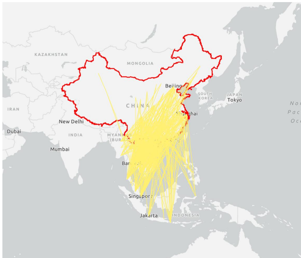
Figure 3. Map showing air travel movements from China to ASEAN countries in January to March 2020

Note: Chinese health officials suspended outbound travel from Wuhan via air and rail since January 23, 2020