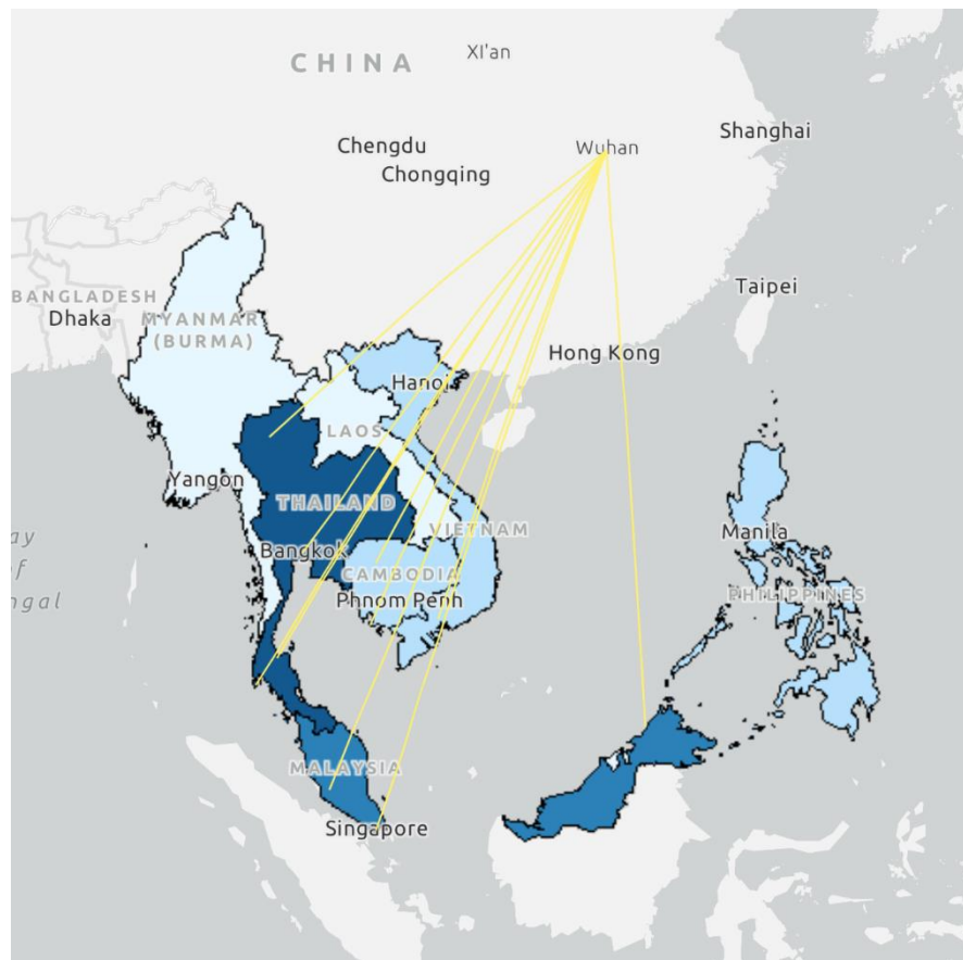
Figure 2. Map showing air travel movements from Wuhan to ASEAN countries in January to March 2020

Note: Chinese health officials suspended outbound travel from Wuhan via air and rail since January 23, 2020