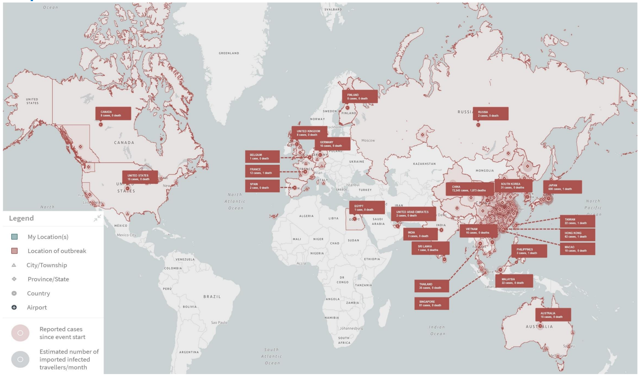
Figure 1. Global map of countries with COVID-19 confirmed cases as of February 19, 2020 (2 PM GMT+8)