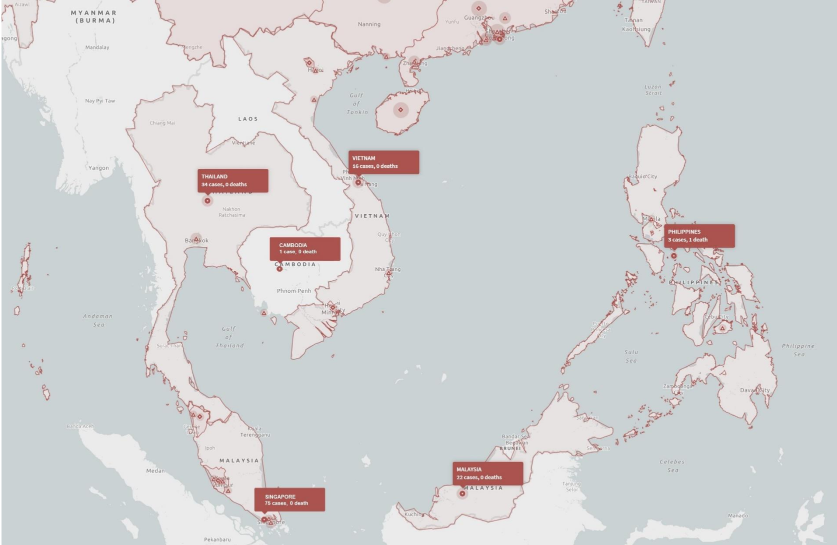
Figure 2. ASEAN Region with COVID-19 confirmed cases as of February 17, 2020 (2 PM GMT+8)