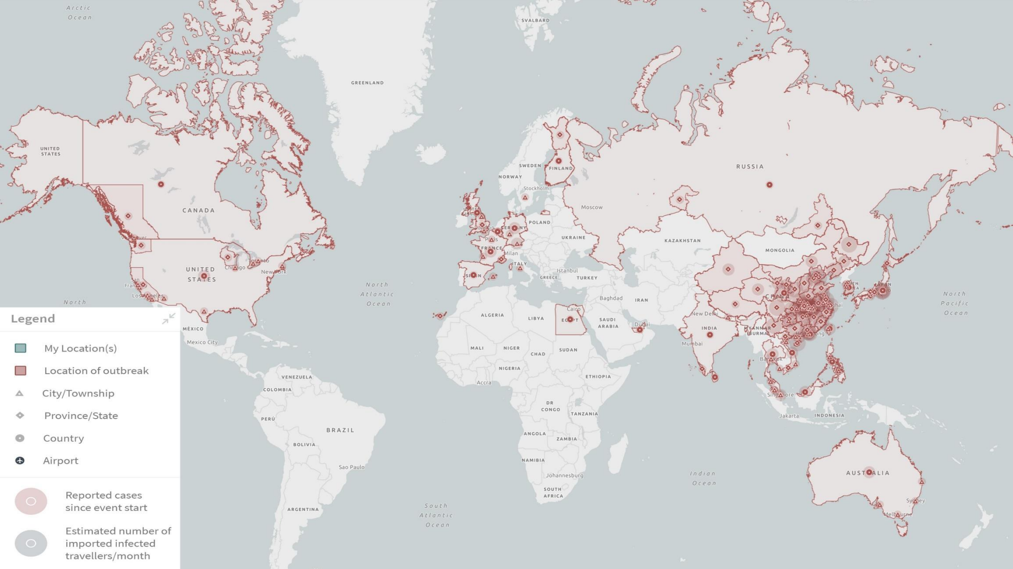
Figure 1. Global map of countries with COVID-19 confirmed cases as of February 17, 2020 (2 PM GMT+8)