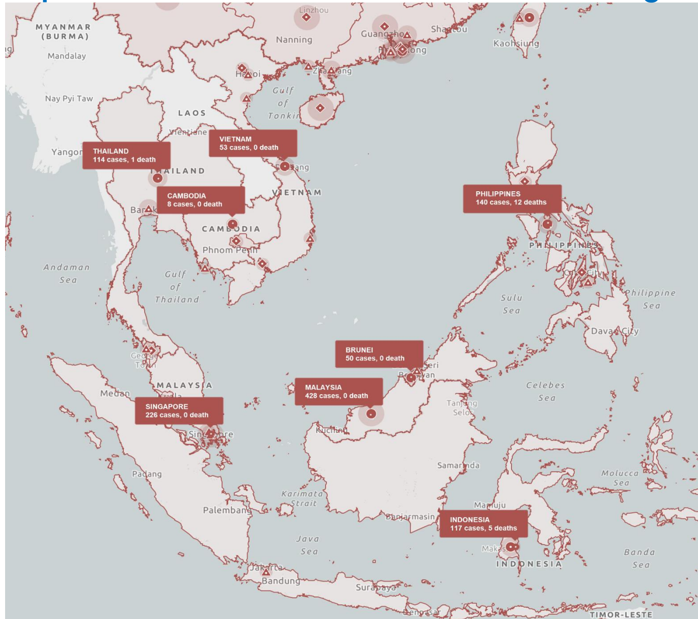
Figure 2. ASEAN Region with COVID-19 confirmed cases as of March 16, 2020 (2 PM GMT+8)