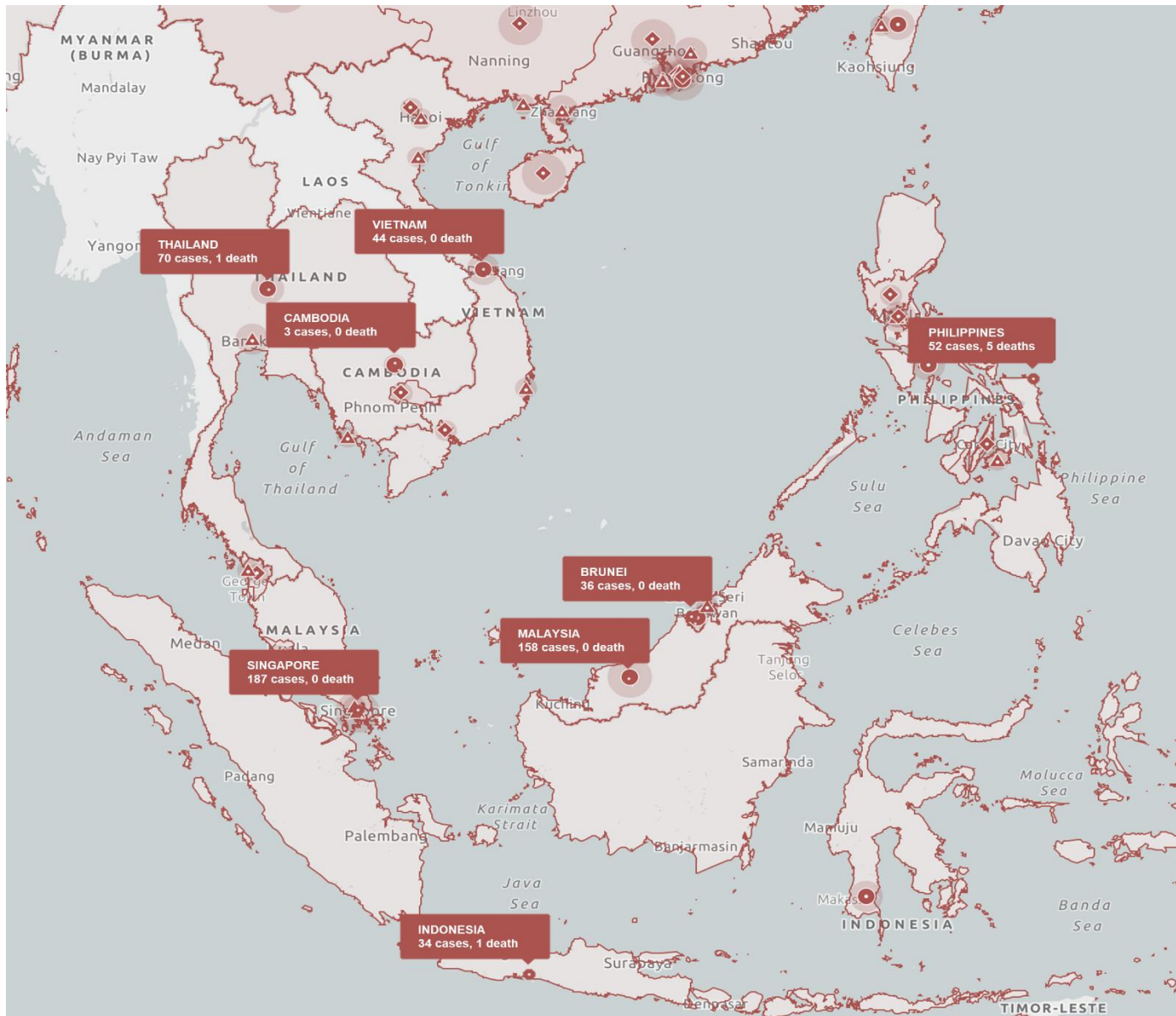
Figure 2. ASEAN Region with COVID-19 confirmed cases as of March 13, 2020 (2 PM GMT+8)