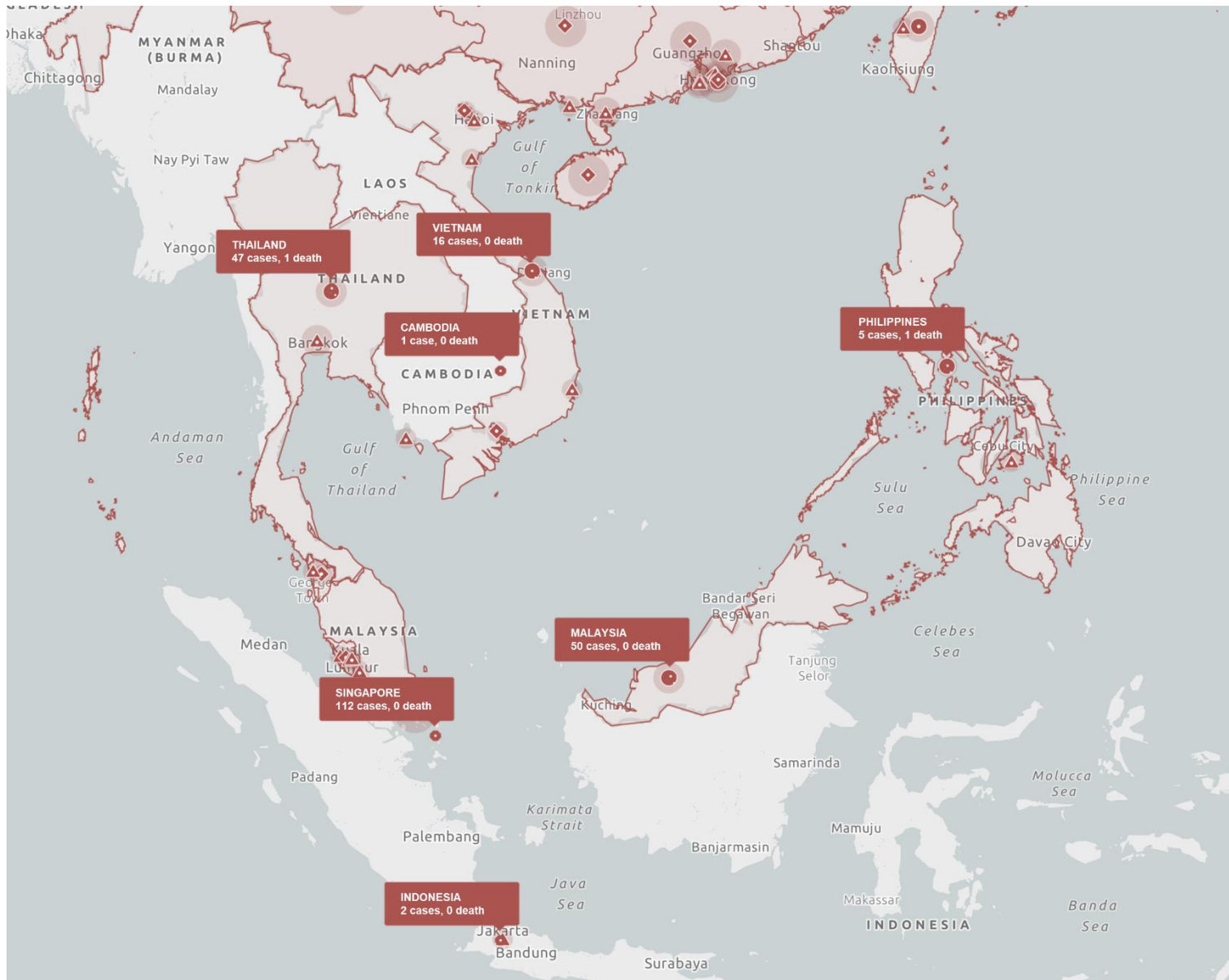
Figure 2. ASEAN Region with COVID-19 confirmed cases as of March 6, 2020 (2 PM GMT+8)