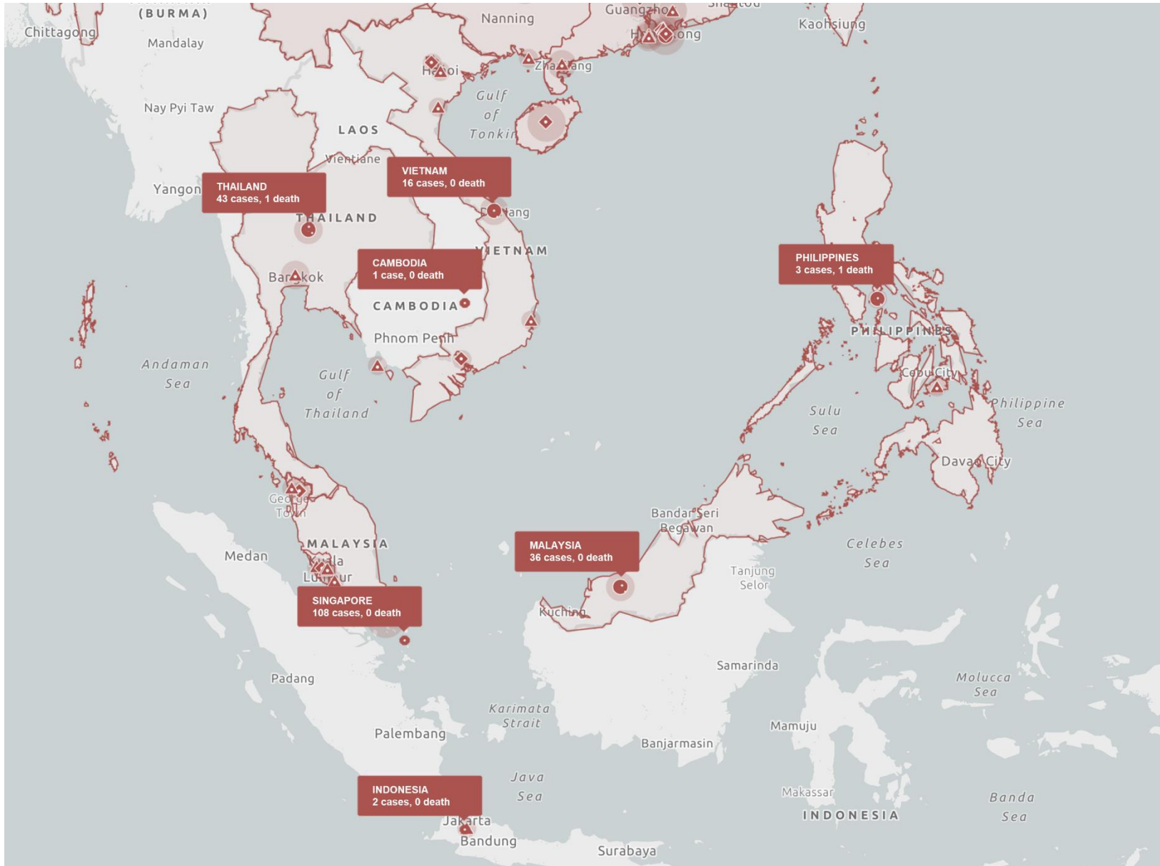
Figure 2. ASEAN Region with COVID-19 confirmed cases as of March 4, 2020 (2 PM GMT+8)