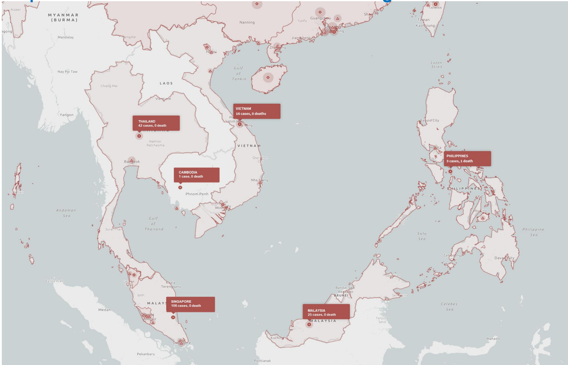
Figure 2. ASEAN Region with COVID-19 confirmed cases as of March 2, 2020 (2 PM GMT+8)