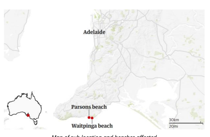
Map of sub location and beaches affected

On March 18, 2025, over 100 surfers developed coughing, eye irritation, sore throat, and blurred vision after visiting Waitpinga and Parsons beaches in South Australia. The beaches, now closed, had mysterious foam suspected to be linked to fish kills and a local flu outbreak. Investigations are ongoing.